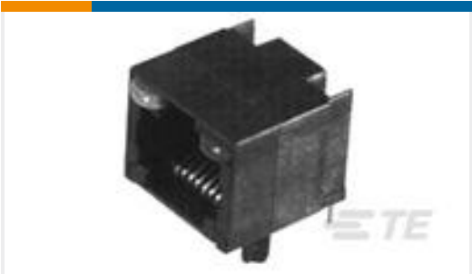
TE Part #5406533-1 INV MOD JACK,1X1,LED (G/Y)