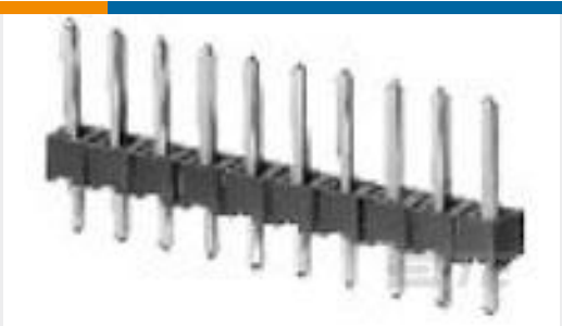
TE Part #5-146274-2 02 MODII HDR SRST B/A .100CL