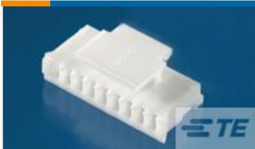
TE Part #1-1735447-0 HPI 2.0 RECEPTACLE HOUSING, 10P