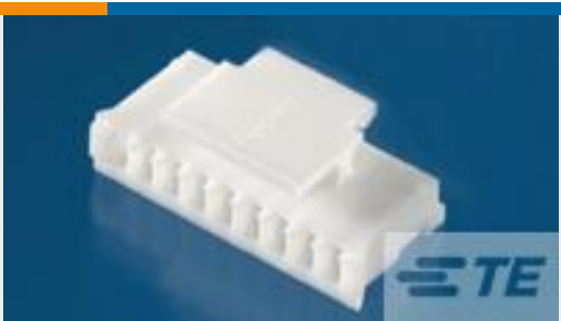
TE Part # 1-1735447-0 HPI 2.0 RECEPTACLE HOUSING, 10P