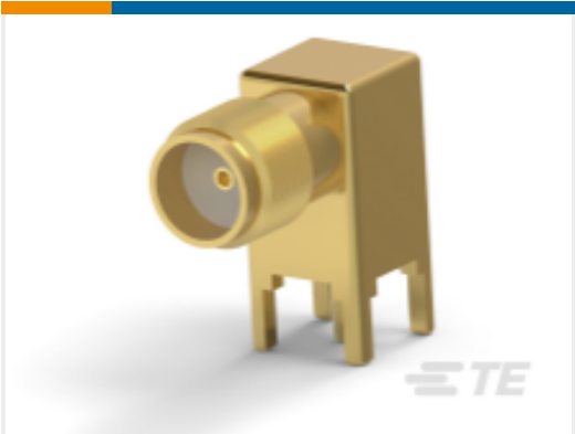
TE Part #5-1814400-2 SMA R/A PCB Skt GZD

2MM PITCH HPI POST HEADER, VERTICAL, 10P