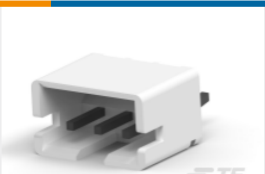
TE Part #1-1735446-2 AMP HPI 2.0 mm Headers