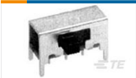
TE Part #1825232-1 SLIDE SWITCH,SPDT,Right Angle