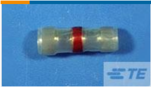
TE Part #448859-000 D-1744-01