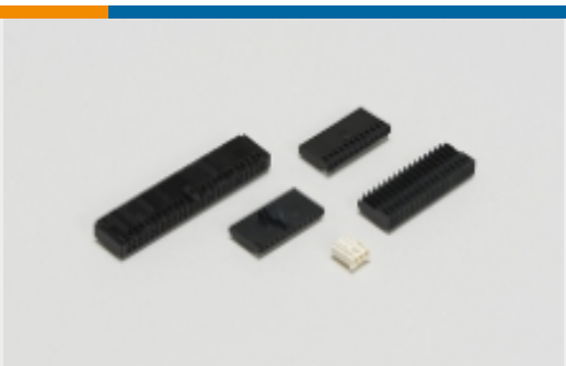
Wire-to-Board Connector Assemblies & Housings(5)