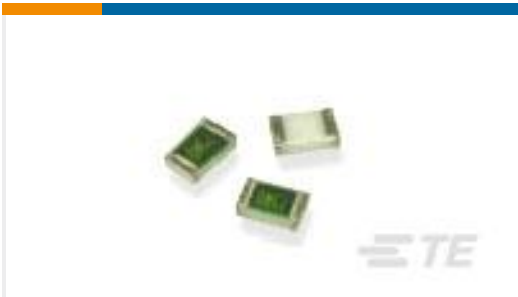
TE Part #1676282-3 RN 0805 2K0 0.1% 10PPM 5KRL