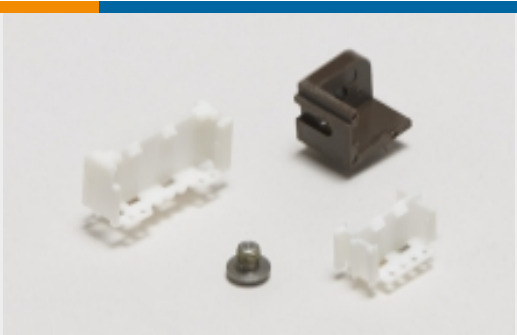
PCB Connector Mounting(1)