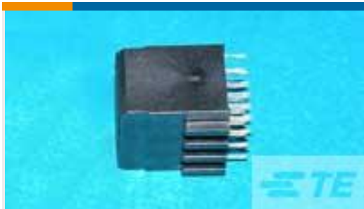
TE Part #1410270-2 MULTIGIG RT PWR .8" VRT RCP 4P PBFR