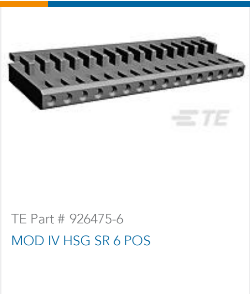
TE Part # 926475-6 MOD IV HSG SR 6 POS