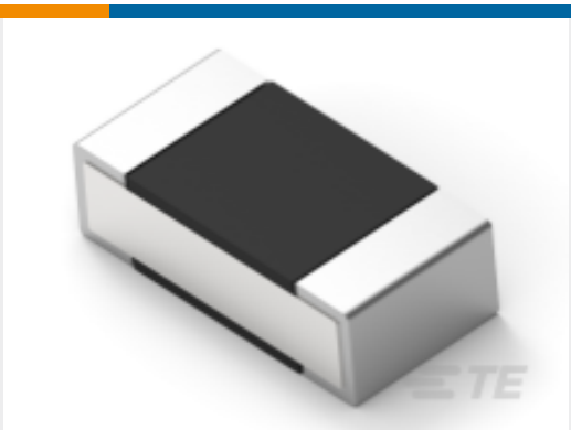
TE Part #1-2176308-8 RP 1E 0.1W 200K 0.1% 25PPM 5K RL