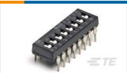
TE Part #4-1825059-1 ADF08ST04=DIP SWT,FLUSH,SMT-GW