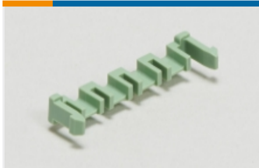
PCB Latches, Locks & Retainers(1)