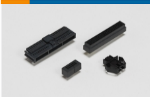
PCB Connector Shrouds(1)