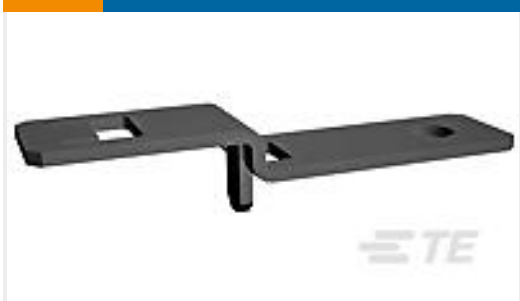
TE Part #5900121-2 DYNAMIC D-3 FREE HANGING HOOK