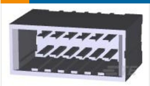
TE Part #178326-2 DYNAMIC DBL ROW HDR ASSY 12P V