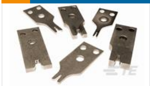
TE Part #1-1633962-5 CRIMPER, INSULATION F PREMIUM