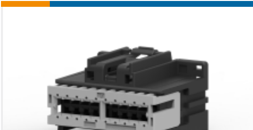
TE Part #2288276-1 Assy, Plug, USCAR, GenY, 20p, Key A, No CPA