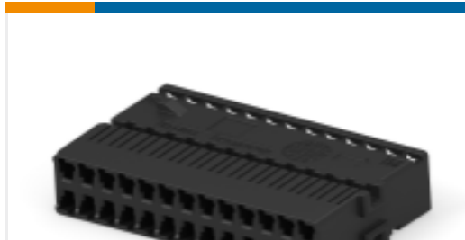
TE Part #1924136-4 Carrier, 26P GenerationY, Hand Mate Conn