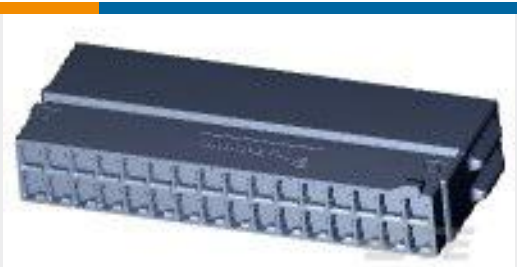
TE Part #2098216-1 32P Carrier, GY