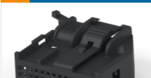
TE Part #2378797-1 Shield, 26P GenY, Hand Mate Conn