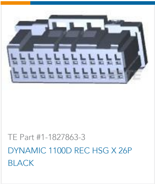
TE Part #1-1827863-3 DYNAMIC 1100D REC HSG X 26P BLACK