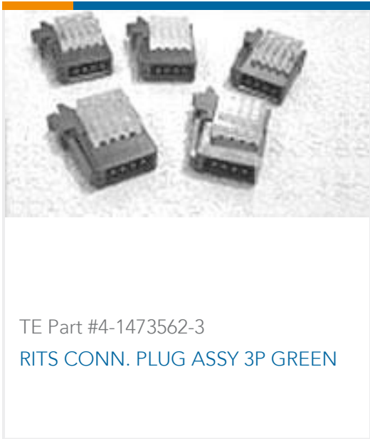
TE Part #4-1473562-3 RITS CONN. PLUG ASSY 3P GREEN