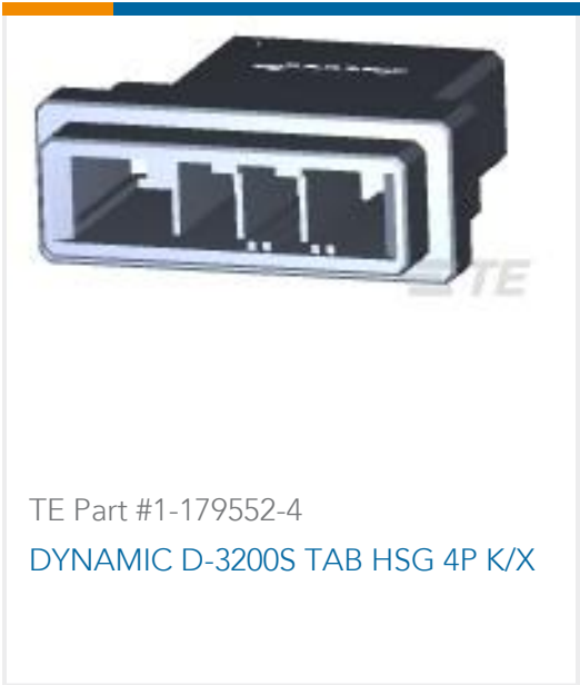
TE Part #1-179552-4 DYNAMIC D-3200S TAB HSG 4P K/X