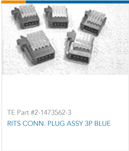
TE Part #2-1473562-3 RITS CONN. PLUG ASSY 3P BLUE