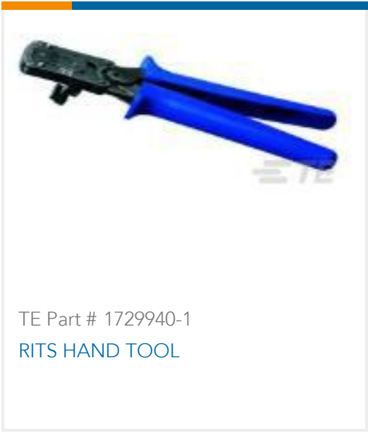
TE Part # 1729940-1 RITS HAND TOOL