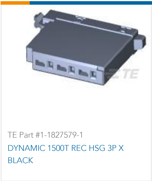
TE Part #1-1827579-1 DYNAMIC 1500T REC HSG 3P X BLACK