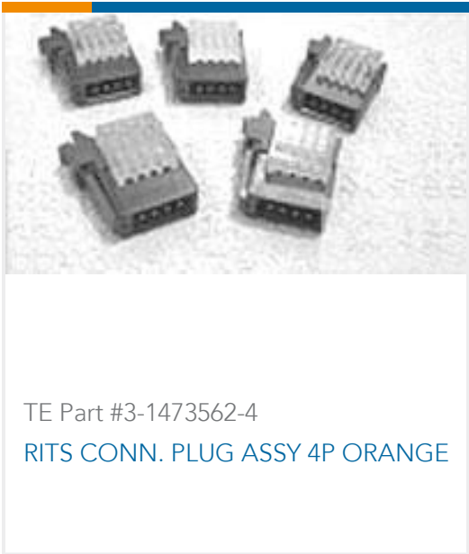
TE Part #3-1473562-4 RITS CONN. PLUG ASSY 4P ORANGE