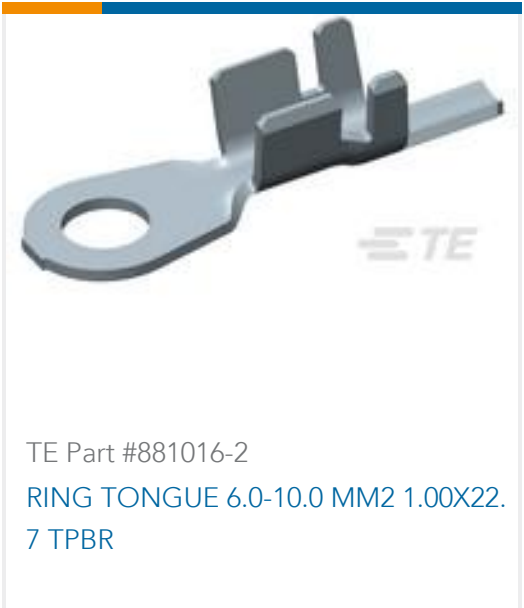
TE Part #881016-2 RING TONGUE 6.0-10.0 MM2 1.00X22. 7 TPBR