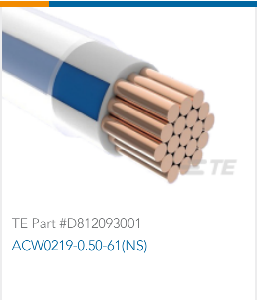
TE Part #D812093001 ACW0219-0.50-61(NS)