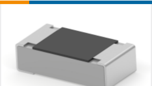
TE Part #1-2176340-9 CRGCQ 0603 1K0 5%