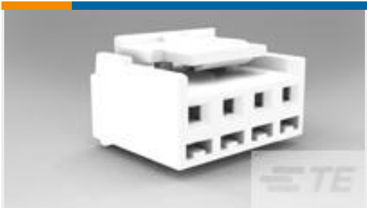
TE Part #2132781-3 03P EP-II HOUSING, NATURAL