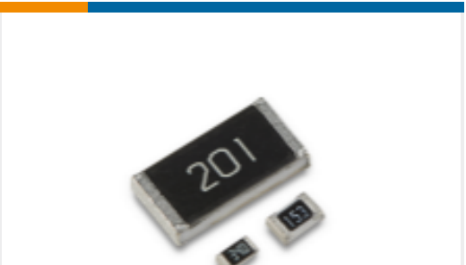
TE Part #3-2176325-7 CRGP 0402 10K 1%