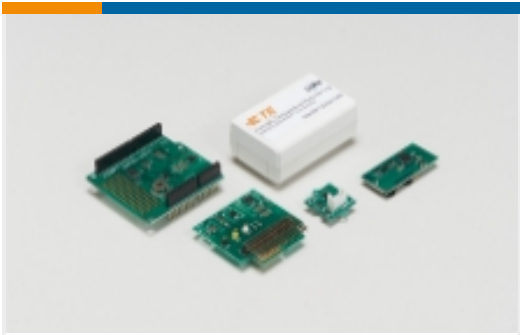
Sensor Development Boards and Evaluation Kits(2)