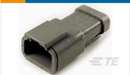
TE Part #DTM04-3P-E003 REC, 3P, GRY, N, CAP