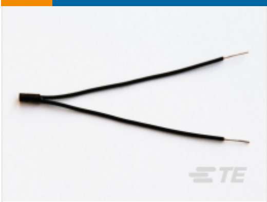
TE Part #GA10K3MBD1 MBD9-PROBE