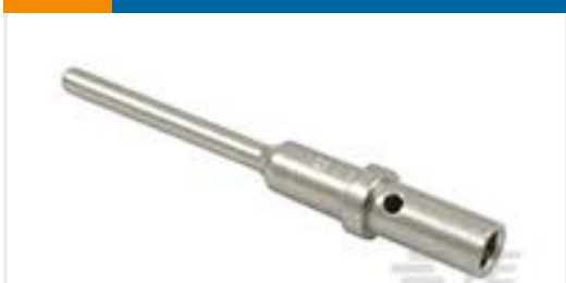
TE Part #0460-202-20141 PIN, SOLID, SIZE 20, 20AWG, NI