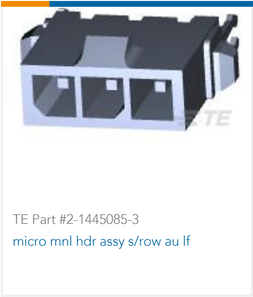
TE Part #2-1445085-3 micro mnl hdr assy s/row au lf